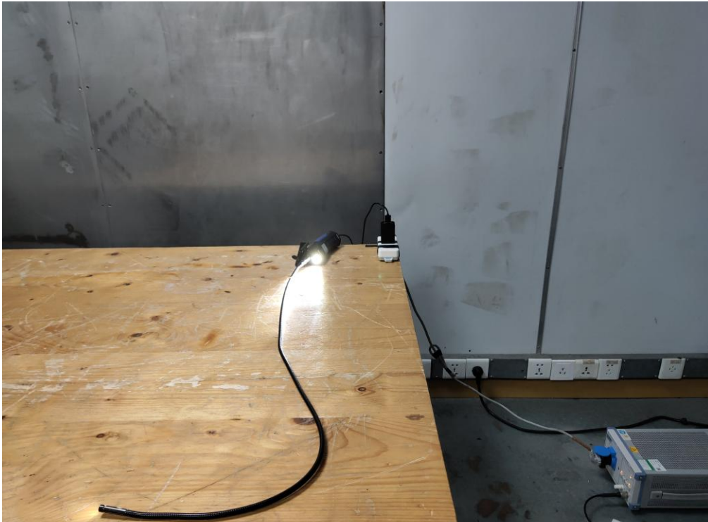
Photo of Conducted Emission Measurement