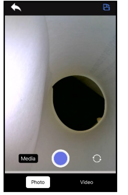
Fig. 15: Live image in the app

As soon as the WLAN connection has been established, the live image of the Wöhler VE 500 appears in the app on the mobile device.