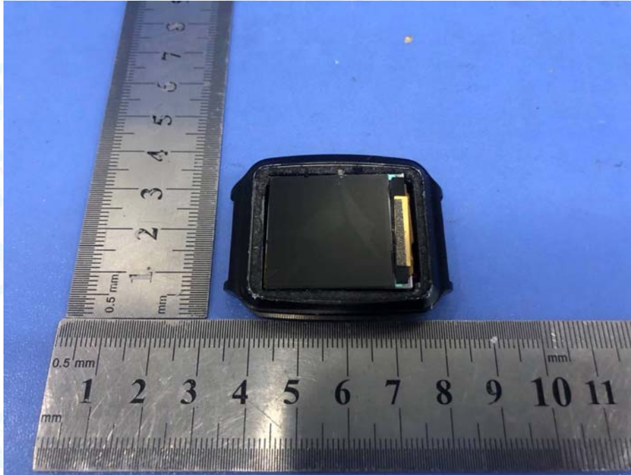
Photo 4 Internal of EUT