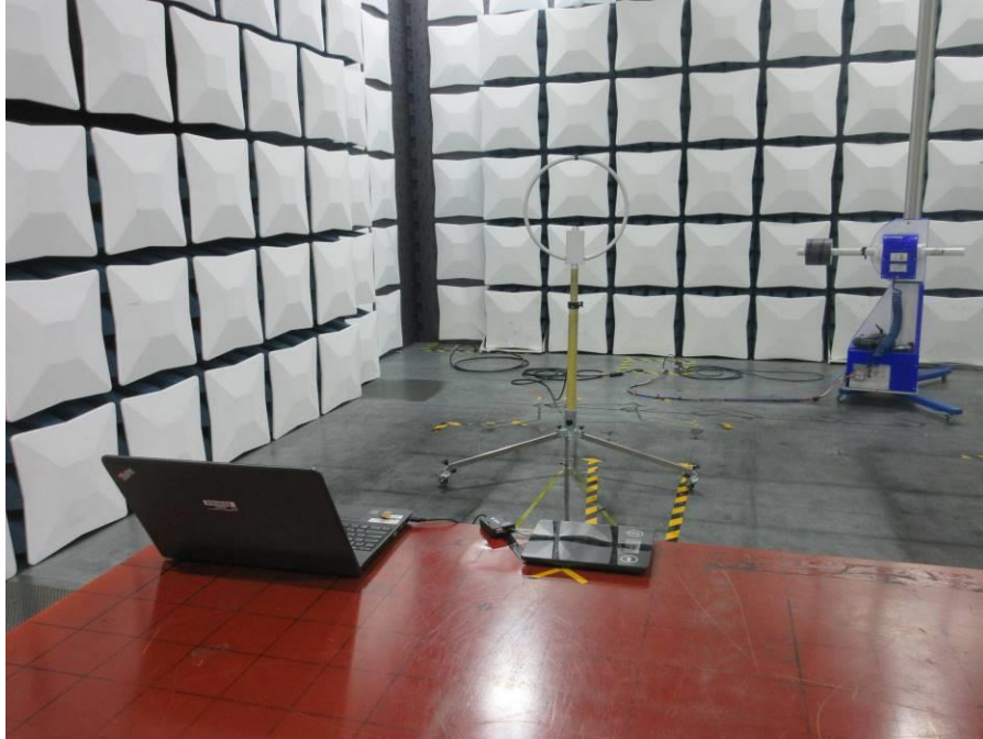
RADIATED RF MEASUREMENT SETUP (30MHz ~ 1 GHz)