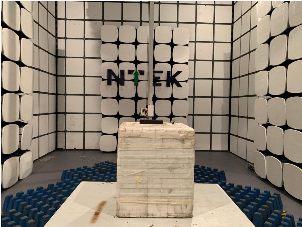
Conducted Measurement Photos