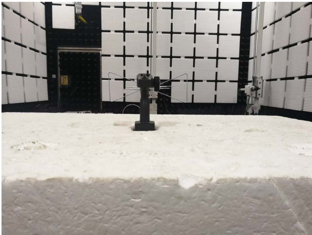
Below 1 GHz