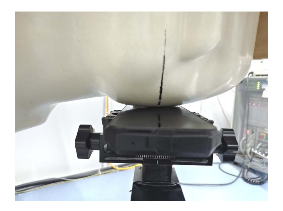
Head Left Tilt Setup Photo