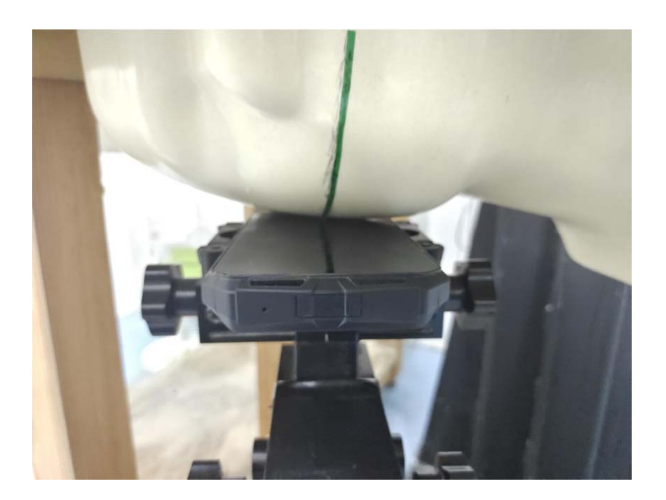
Head Right Tilt Setup Photo