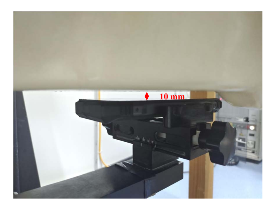
Body (Worn) Back Setup Photo (10mm)