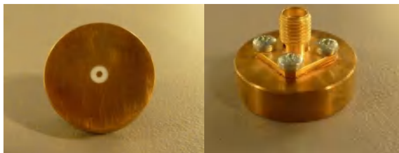
Figure 1 – MVG LIMESAR Dielectric Probe

MVG’s Dielectric Probes are built in accordance to the IEC/IEEE 62209-1528 and FCC KDB865664 D01 standards. The product is designed for use with the LIMESAR test bench only.