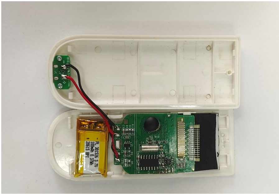
PCB view for all models