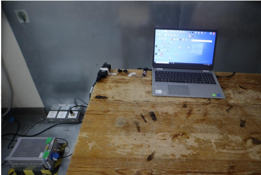
RE (Below 1GHz)