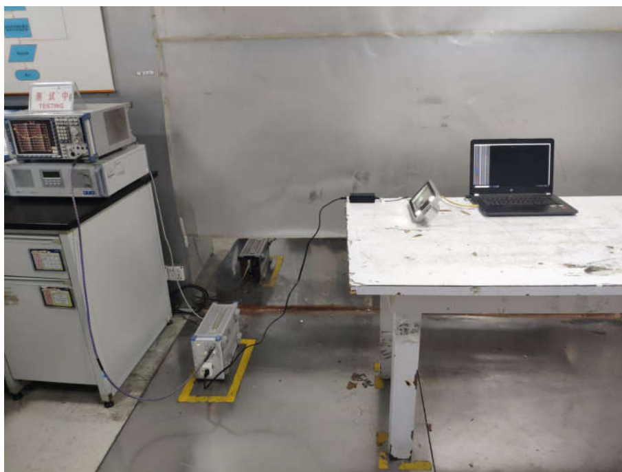
Conducted Emissions Test Setup