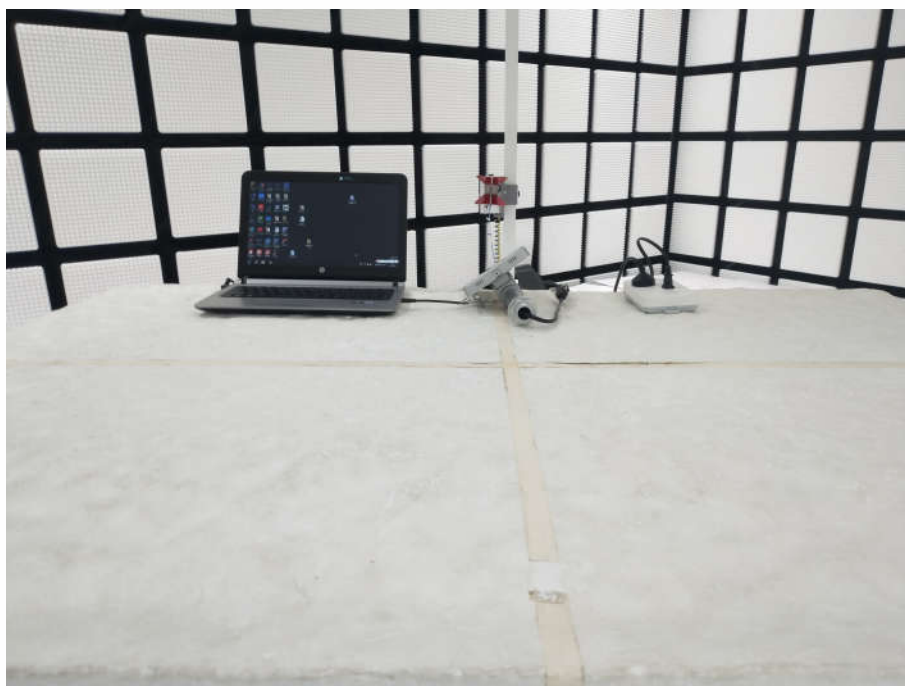
Radiated spurious emission Test Setup-3(Above 1GHz)