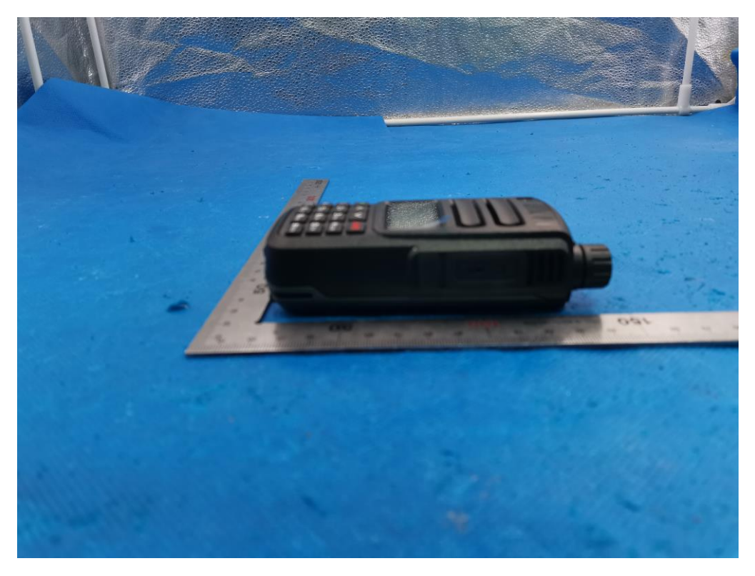
The battery of USB-BAT-C TOP VIEW OF EUT