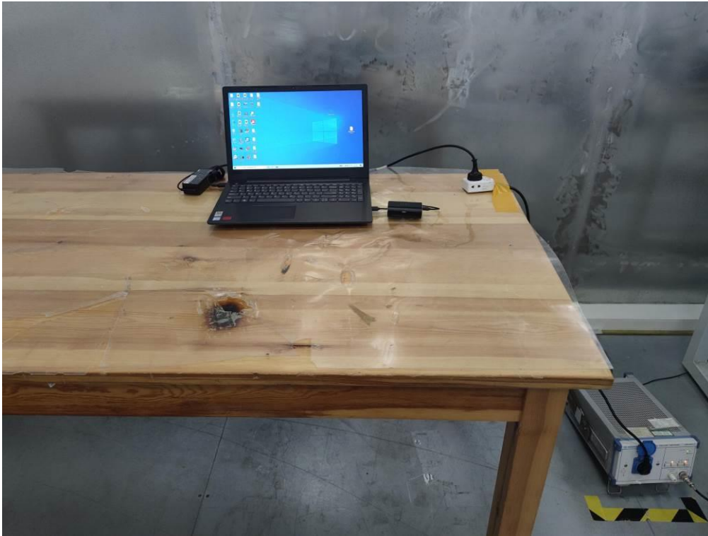
AC Conducted Emission of charge from power adapter mode