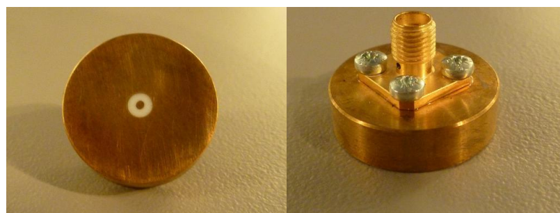
Figure 1 – MVG LIMESAR Dielectric Probe

MVG’s Dielectric Probes are built in accordance to the IEC/IEEE 62209-1528 and FCC KDB865664 D01 standards. The product is designed for use with the LIMESAR test bench only.