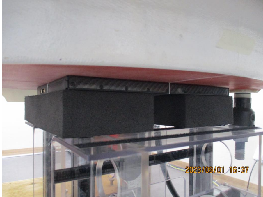
Front Side from Flat Phantom (Separation Distance: 0 cm)

This report shall not be reproduced except in full, without the written approval of KES Co., Ltd. The results shown in this test report refer only to the sample(s) tested unless otherwise stated. The authenticity of the test report, contact kes@kes.co.kr.