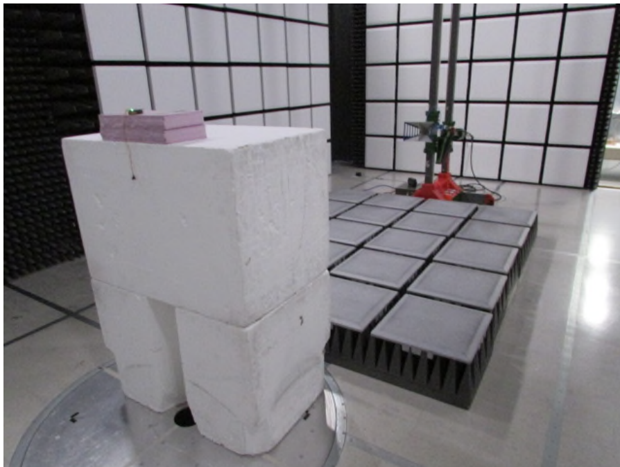
Figure 4: Radiated Emissions – Back –1GHz to 18GHz