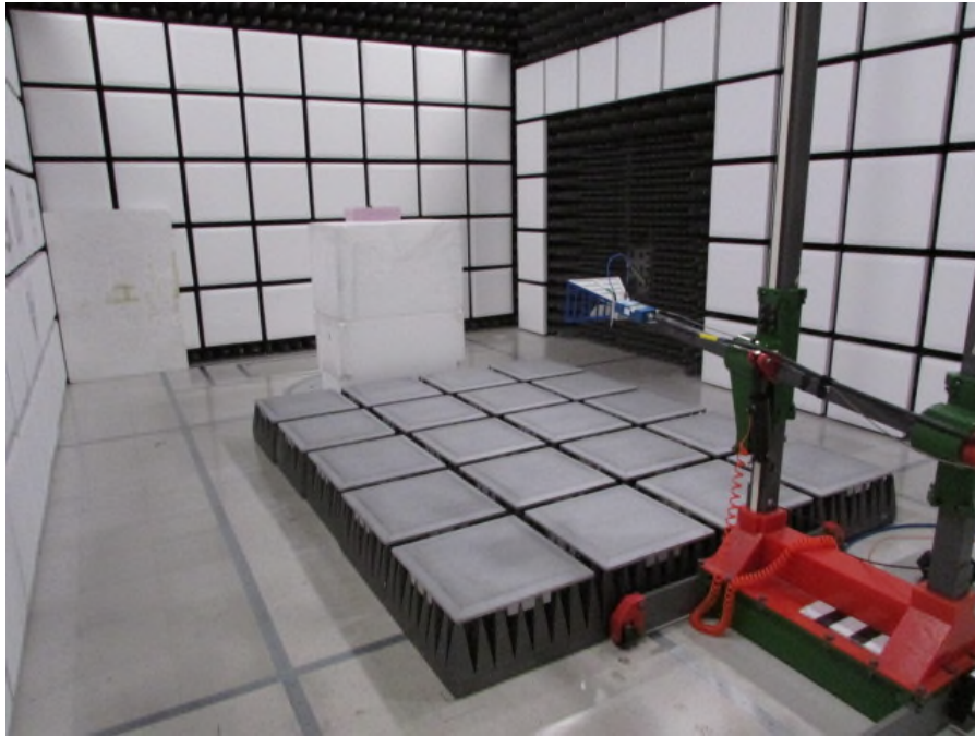
Figure 3: Radiated Emissions – Front –1GHz to 18GHz