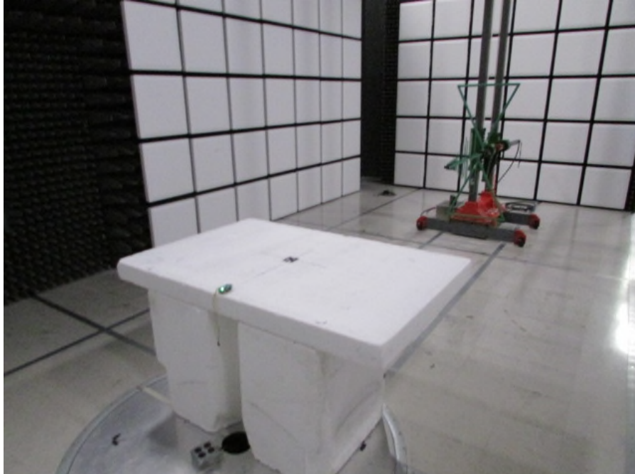
Figure 2: Radiated Emissions – Back – Below 1GHz