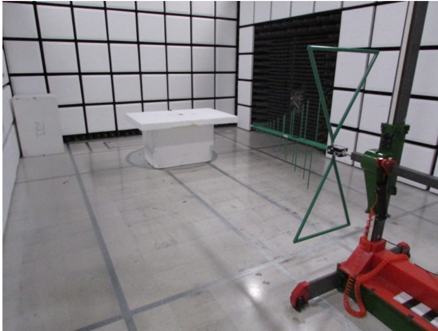
Figure 1: Radiated Emissions – Front – Below 1GHz