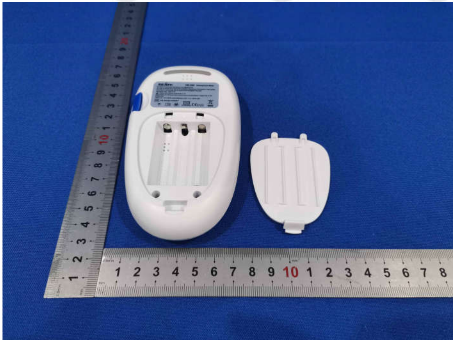
View of Product-8