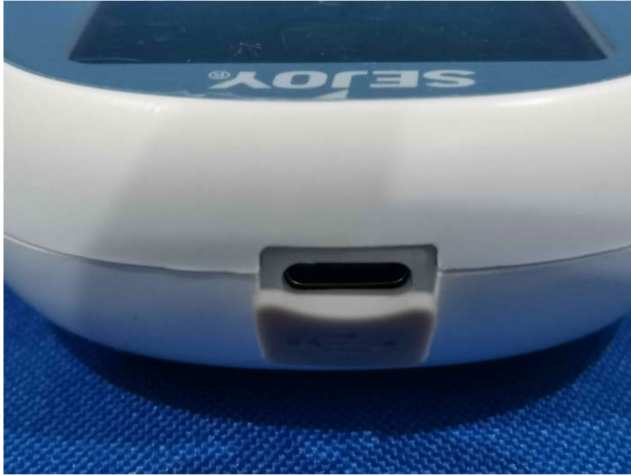
View of Product-9