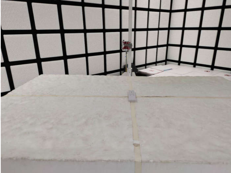
Radiated emission Test Setup-1(Above 1GHz)