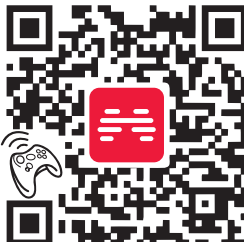
Scan the QR code to follow our Wechat official account