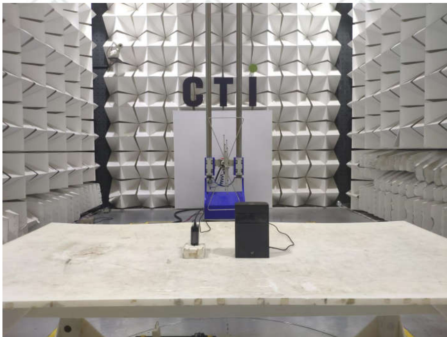
Radiated spurious emission Test Setup-2 (Below 1GHz)