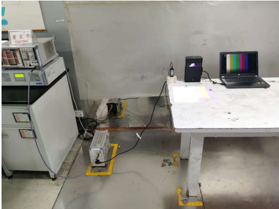
AC Conducted Emissions Test Setup