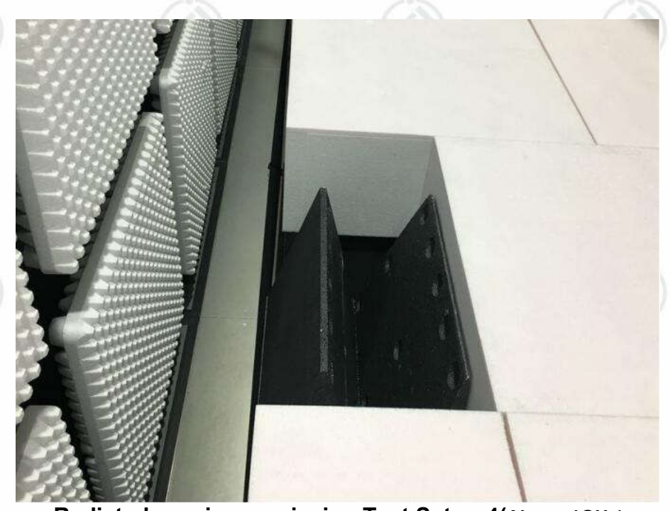
Radiated spurious emission Test Setup-4(Above 1GHz) There are absorbing materials under the ground.