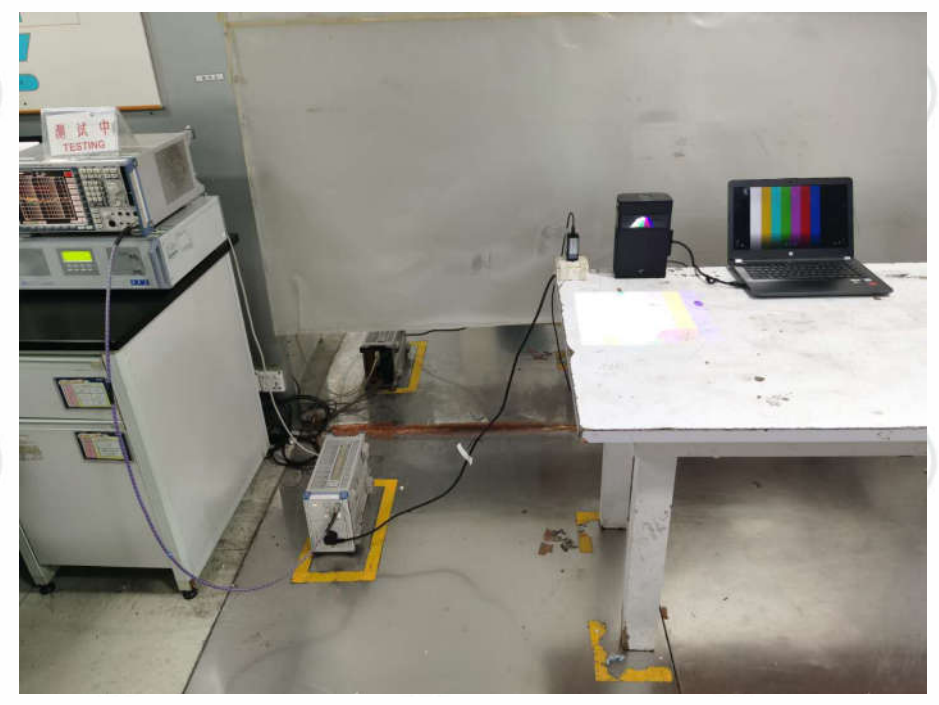
AC Conducted Emissions Test Setup