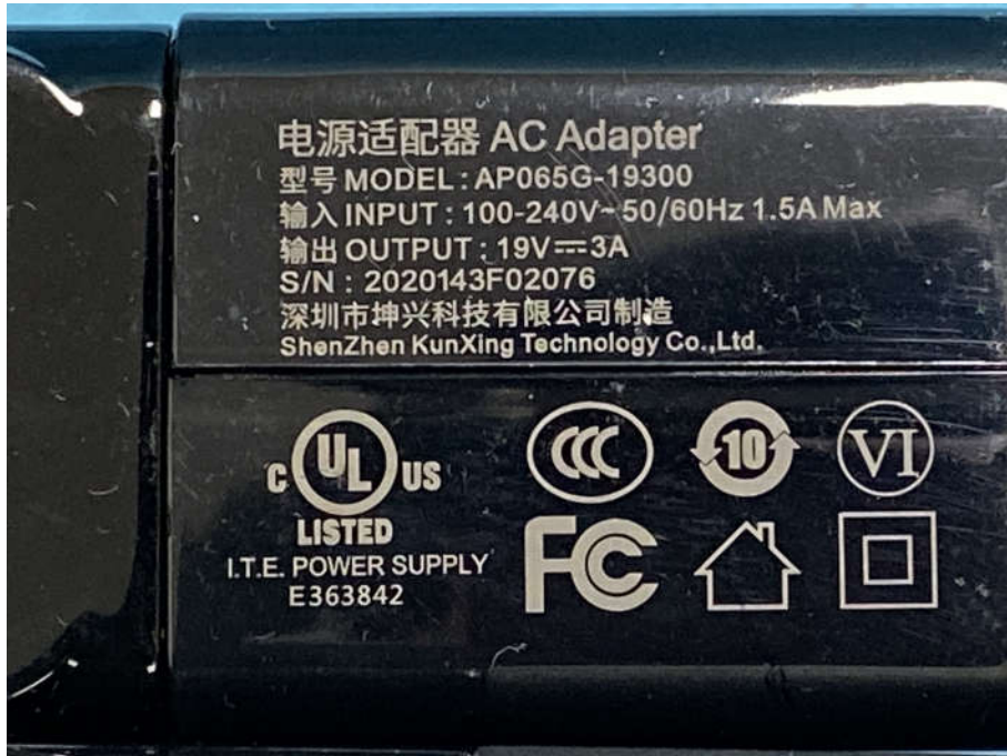
View of Product-9