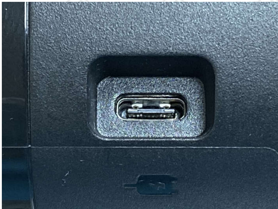
View of Product-10