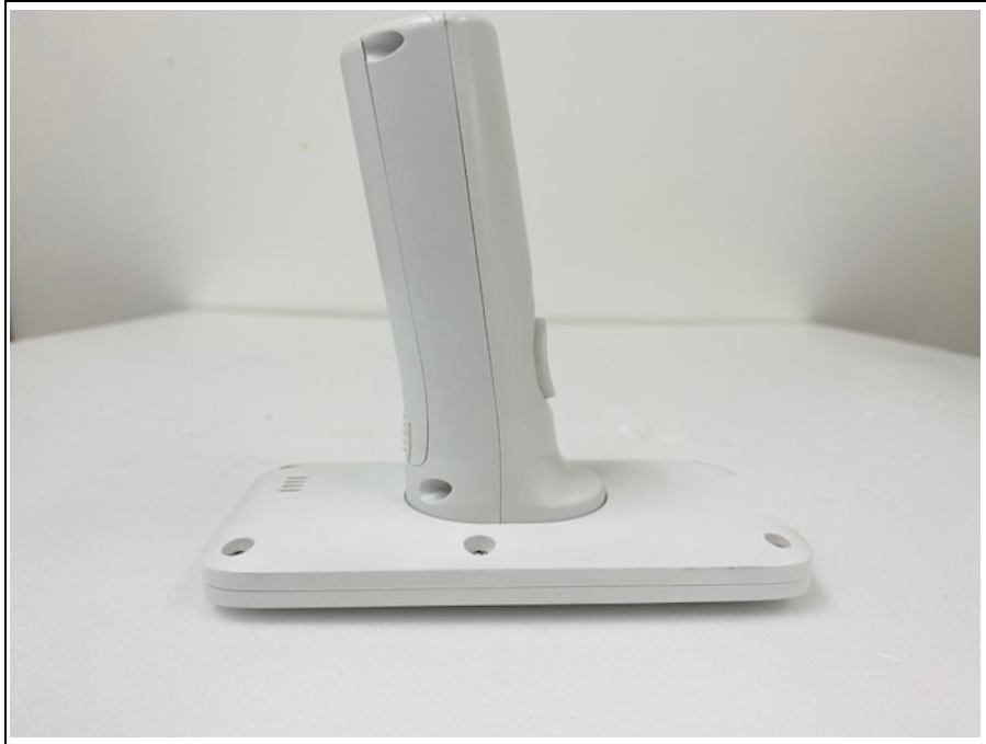
Model name: a611