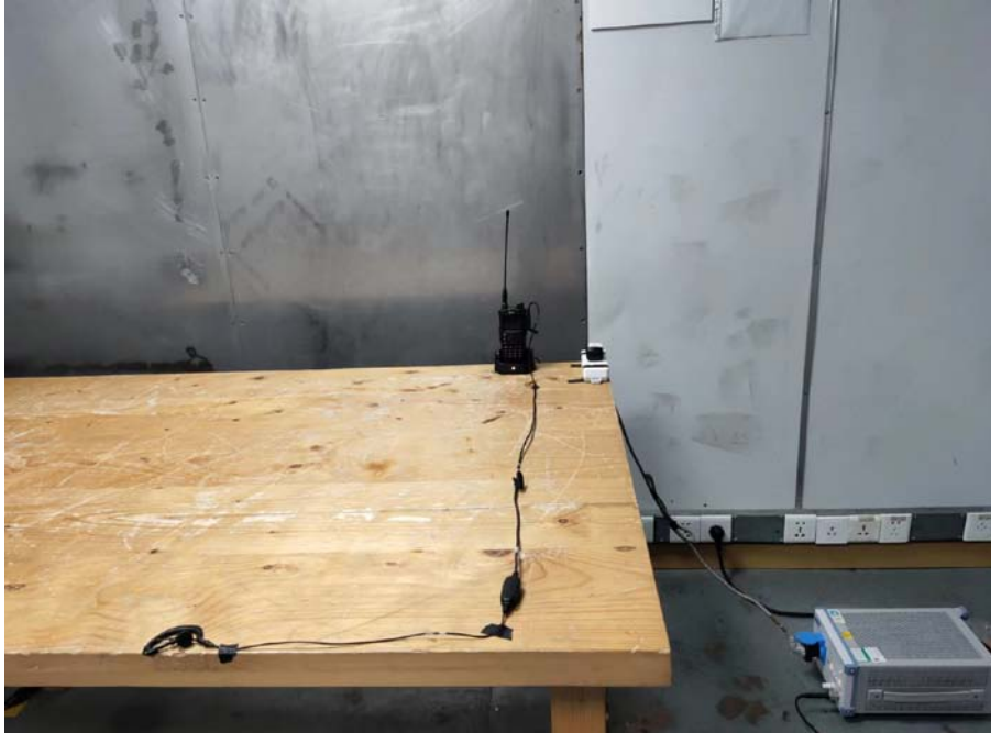
Photo of Power Line Conducted Emission Measurement