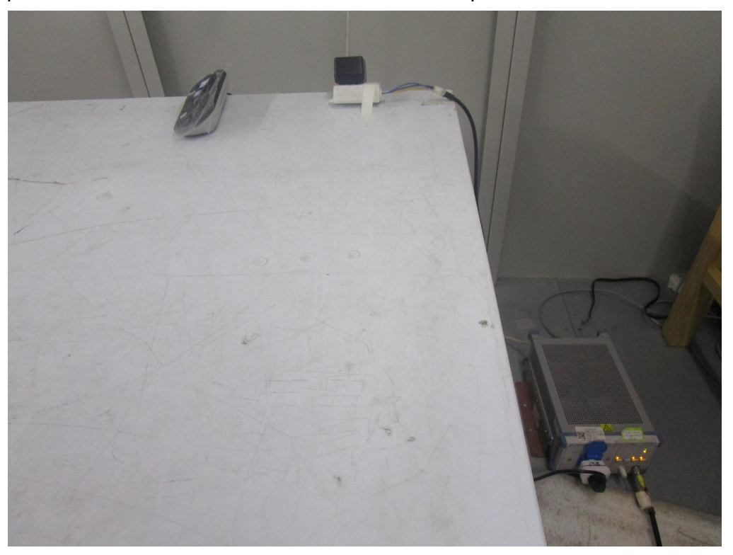
Description: Radiated Emission Test Setup for 30MHz ~ 1GHz

Description: Front view of Conducted Emission Test Setup