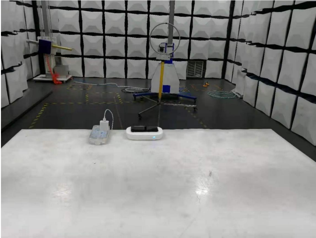
Conduction emission testing device