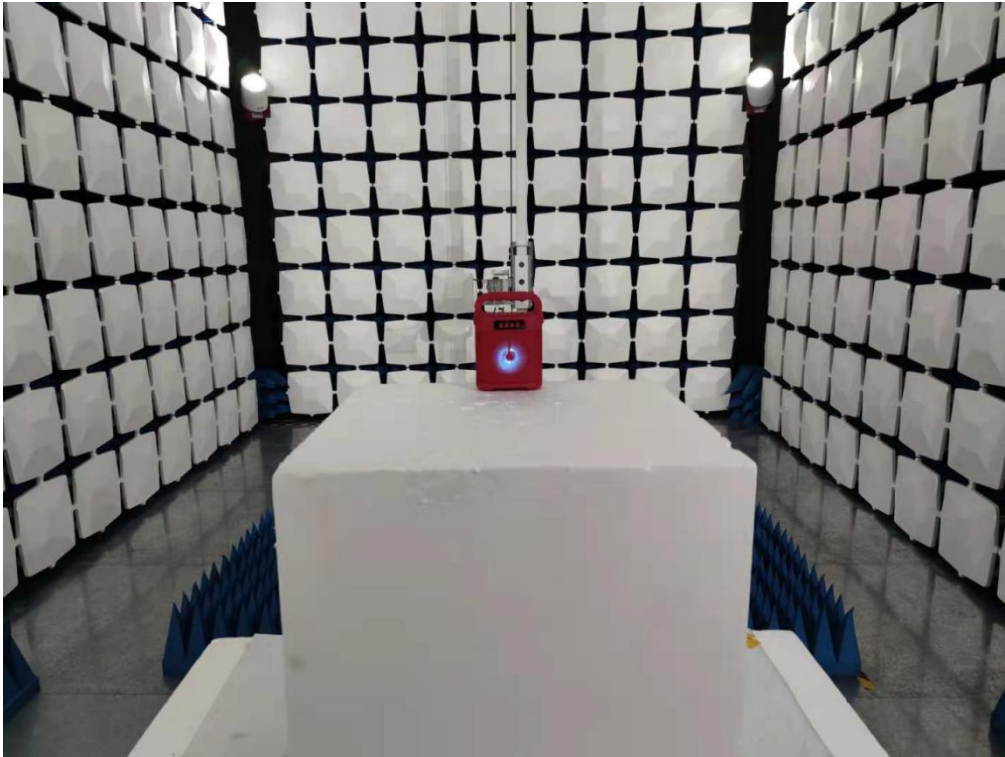
Below 1GHz for radiated emission test setup