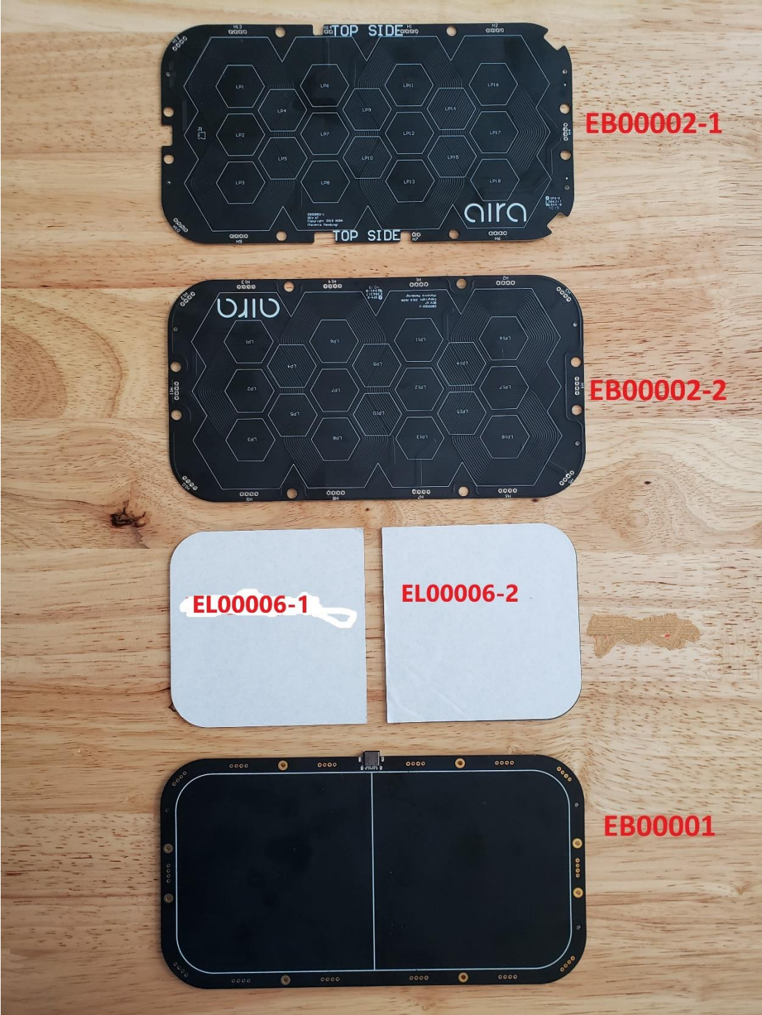
Exhibit 9: Internal photos