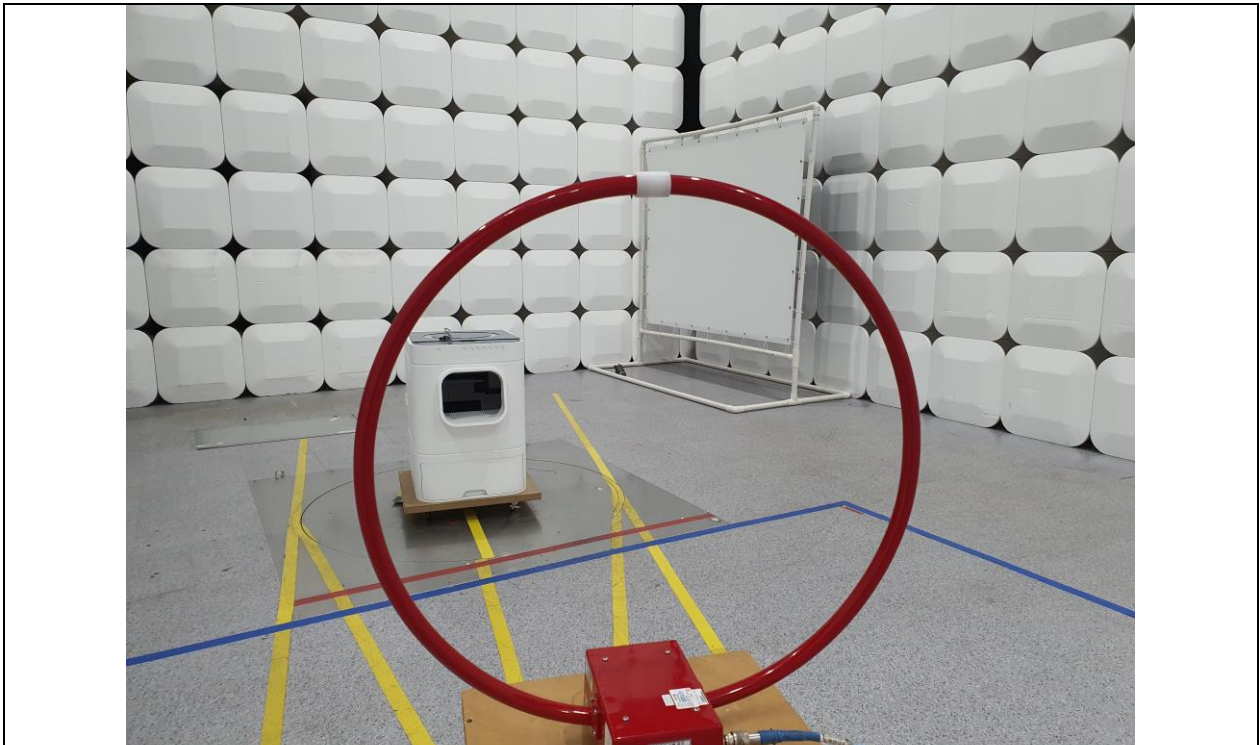
Test distance : 3 m