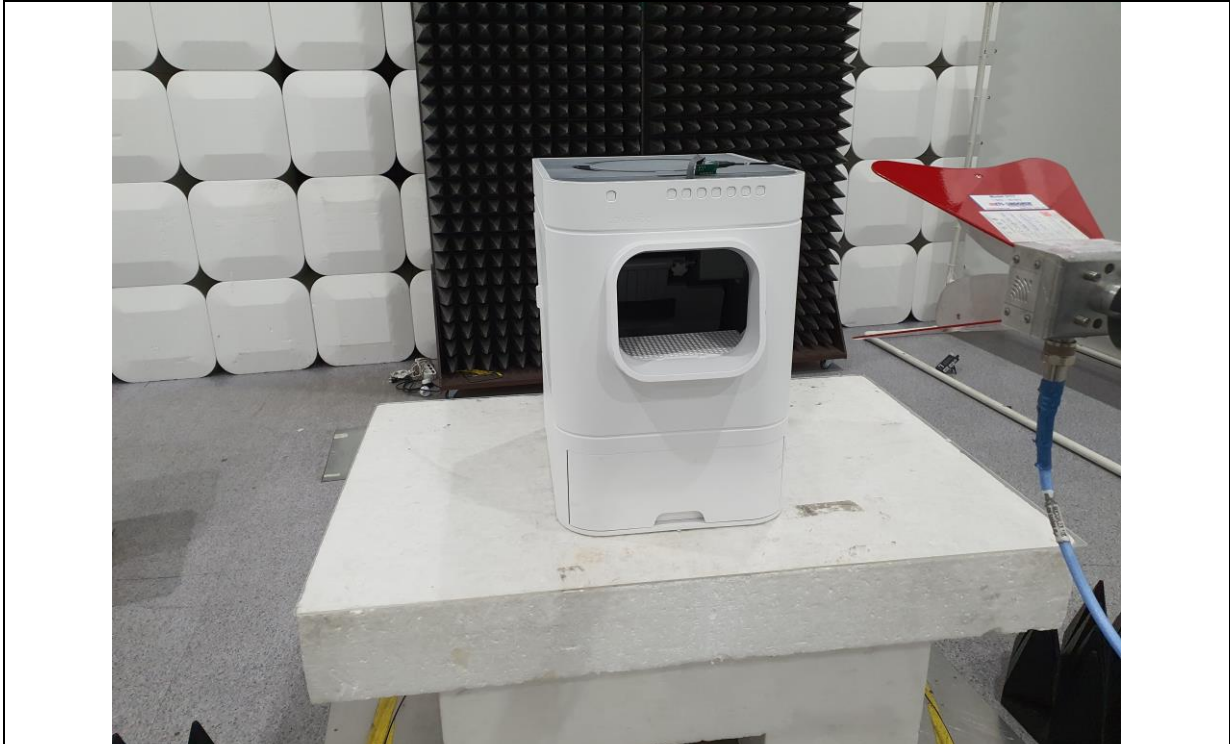
Test distance : 1 m