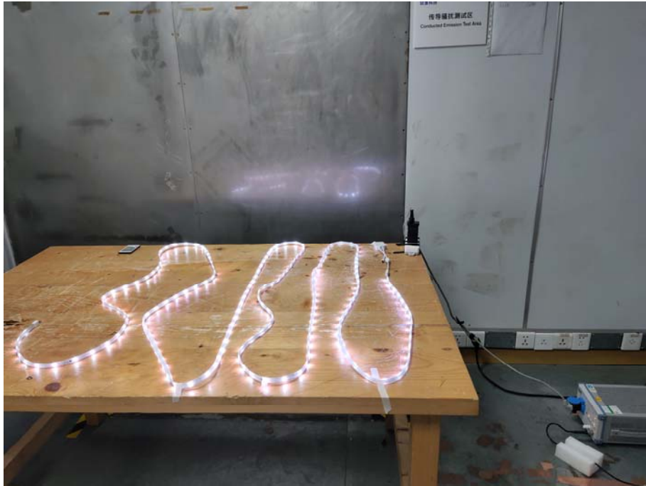
Photo of Conducted Emission Measurement