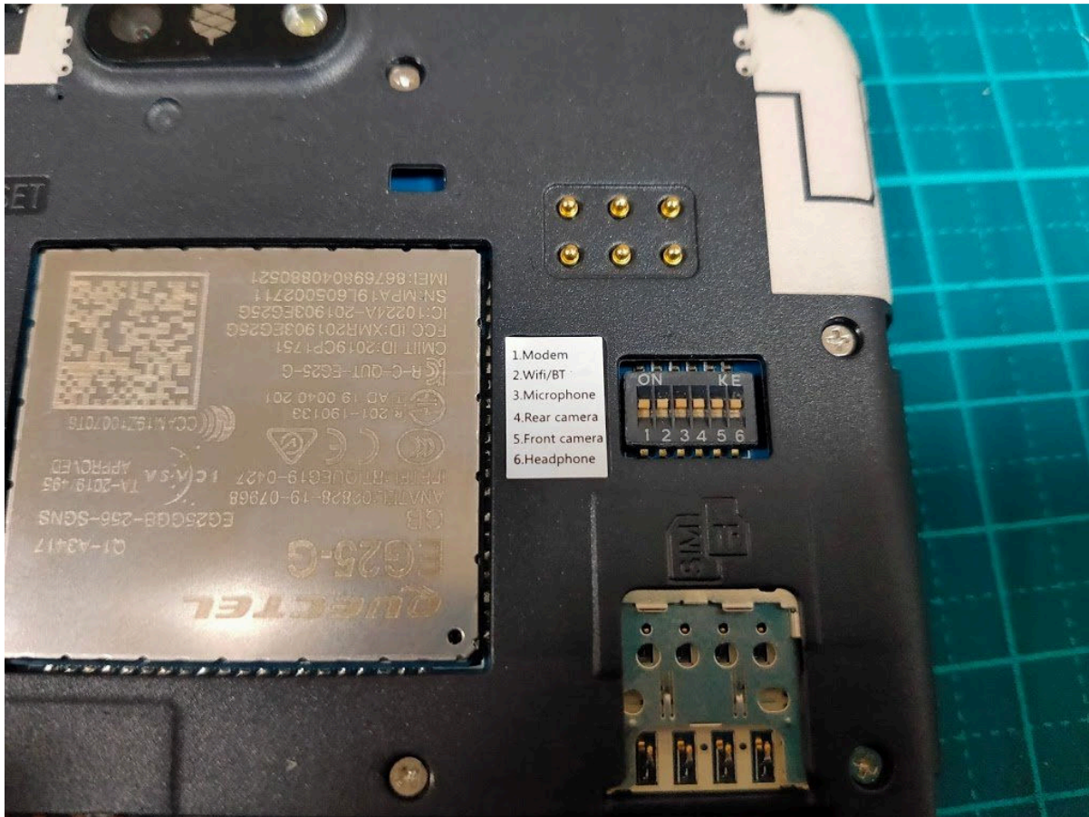
Photo of Brave Heart switches

The PinePhone features six switches that can be used to configure its hardware. They are numbered 1-6, with switch 1 located nearest to the modem. Their on position is toward the top of the phone.