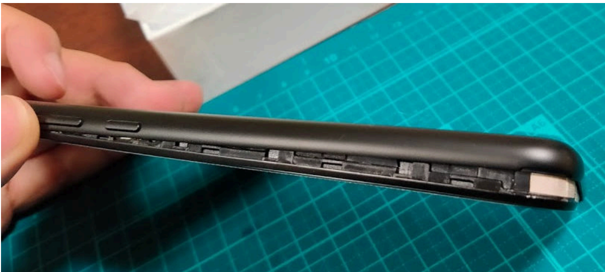
Photo of Brave Heart case

Your Brave Heart phone ships with a plastic sticker between the battery and the phone. You need to open the back cover (gently), then remove the battery and finally remove the sticker. This is to protect the device from turning on during shipping.