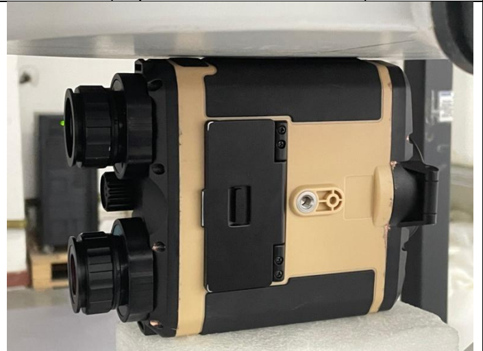
Right Side (Separation distance of 0mm)