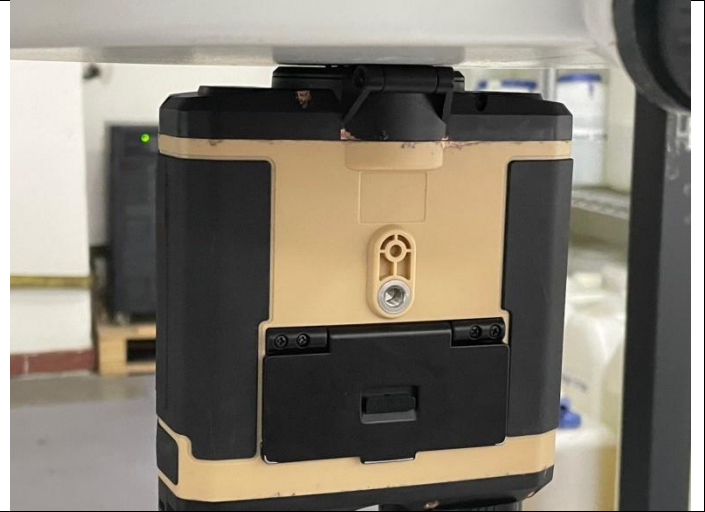
Back Side (Separation distance of 0mm)