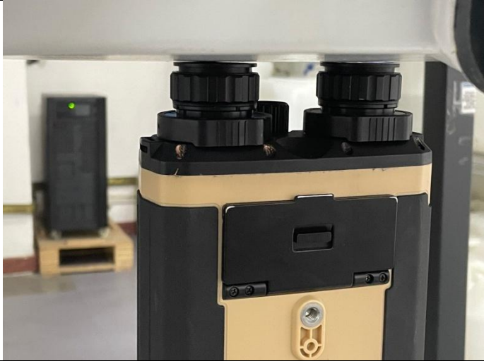
Front Side (Separation distance of 0mm)