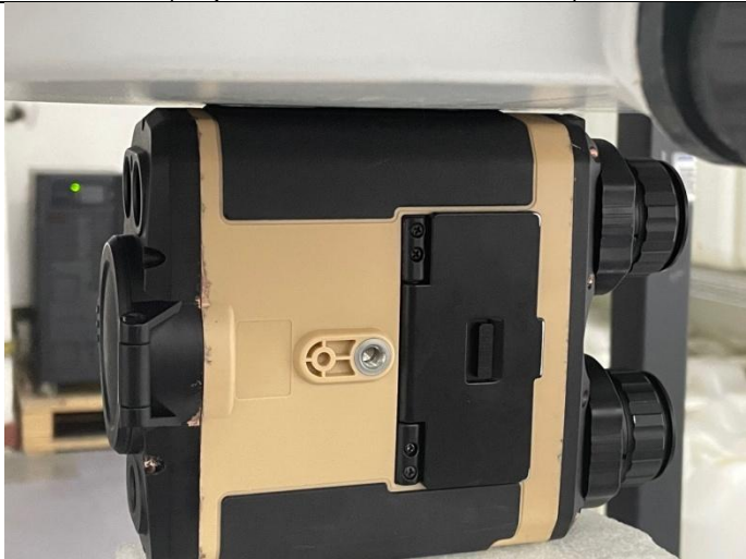
Left Side (Separation distance of 0mm)