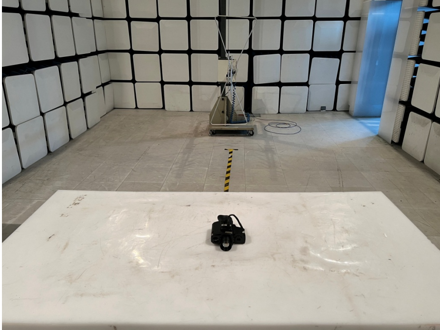
30MHz - 1GHz