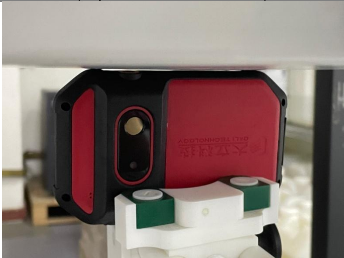
Left Side (Separation distance of 0mm)