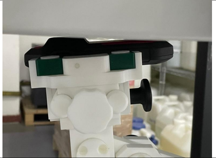
Back Side (Separation distance of 0mm)