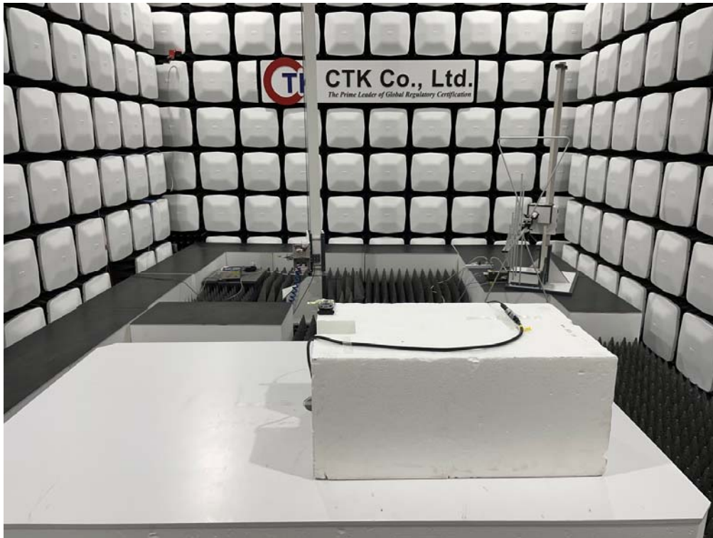
18 GHz to 26.5 GHz