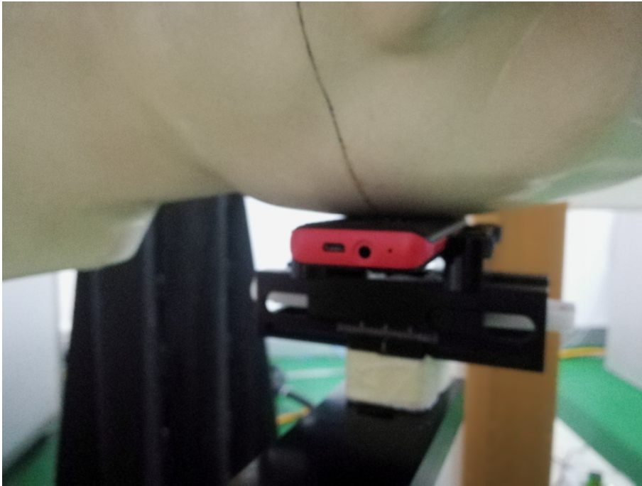
Head Left Tilt Setup Photo