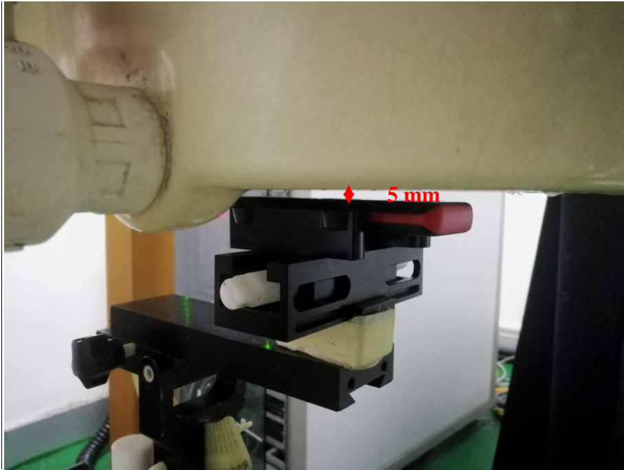
Body (Worn) Front Setup Photo (5mm)