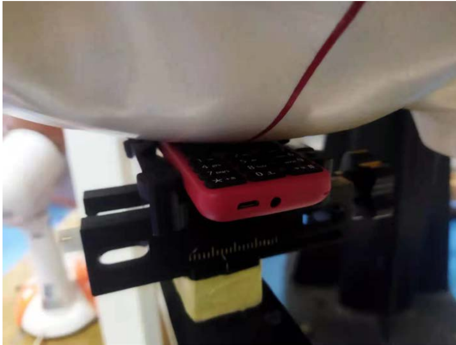
Head Right Tilt Setup Photo