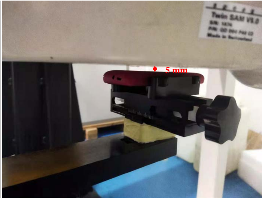
Body (Worn) Front Setup Photo (5mm)