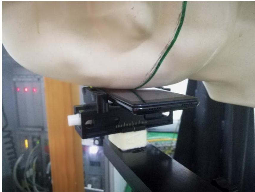
Head Right Tilt Setup Photo