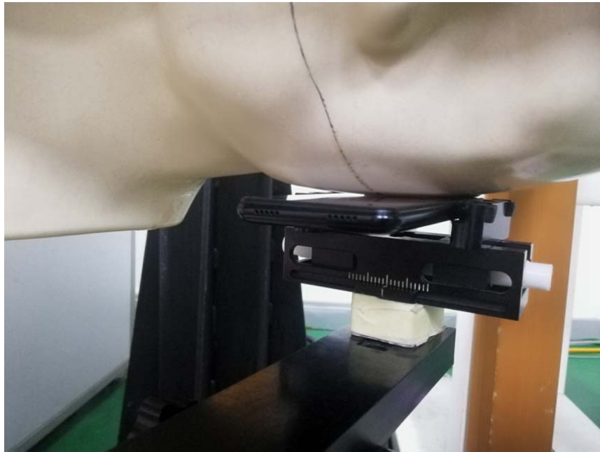
Head Left Tilt Setup Photo