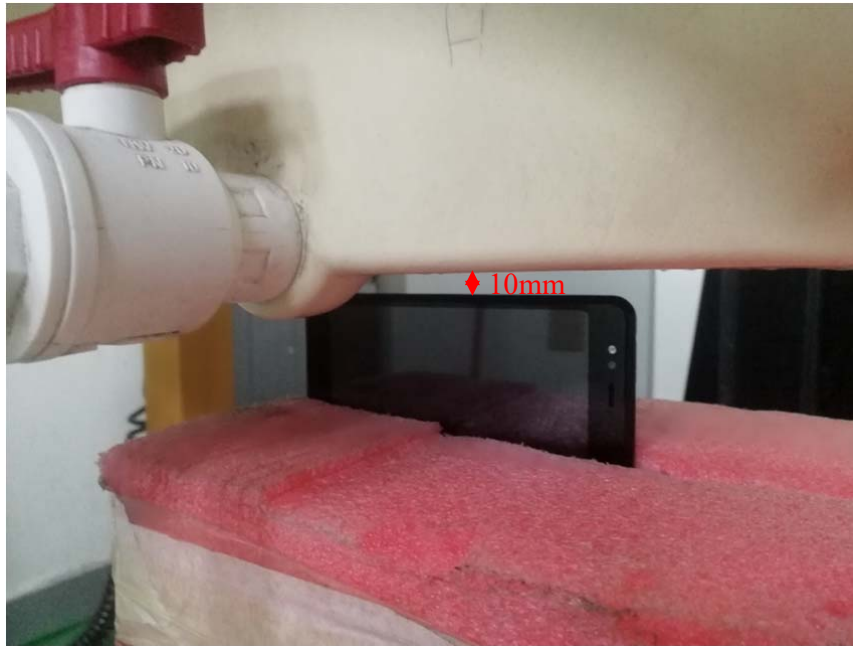
Body Right Setup Photo(10 mm)