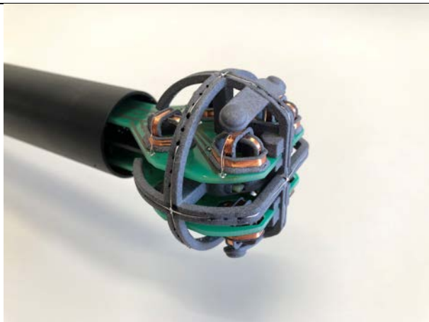
Test probe, without the casing