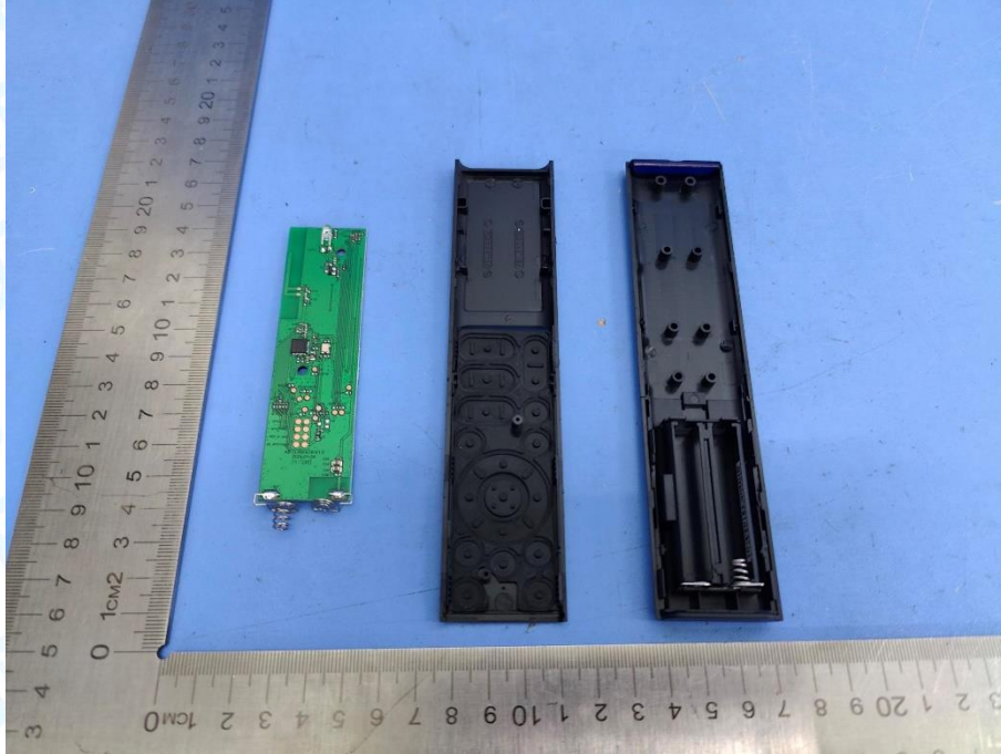
Photo 8 Appearance of PCB