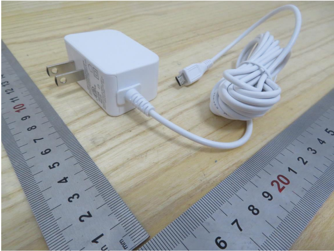
View of EUT-4