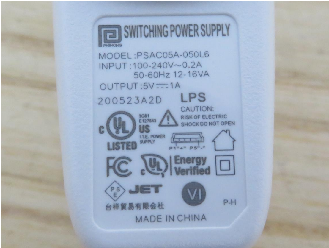
View of EUT-8(VPH 04 PU)