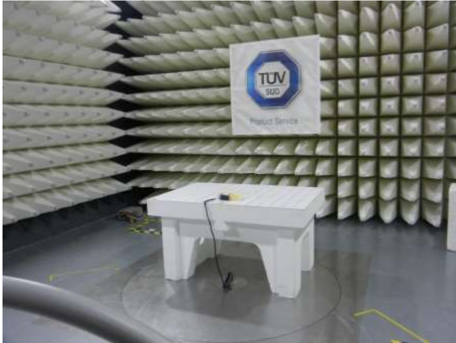
9 kHz – 30 MHz