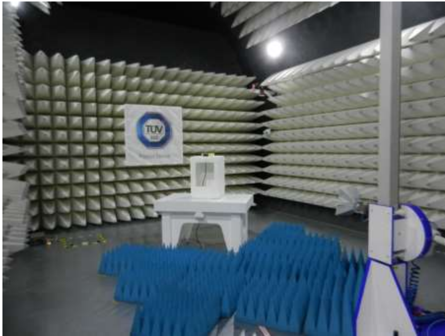
> 1 GHz with HF907 as sample antenna