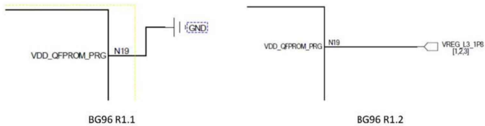
Figure 1: Schematic Designs of BG96 R1.1 and R1.2