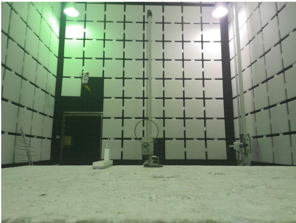
Radiated Emission below 30MHz-AC adapter charge mode