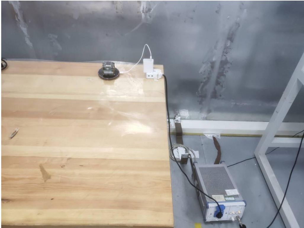
Conducted Emission-AC adapter charge mode