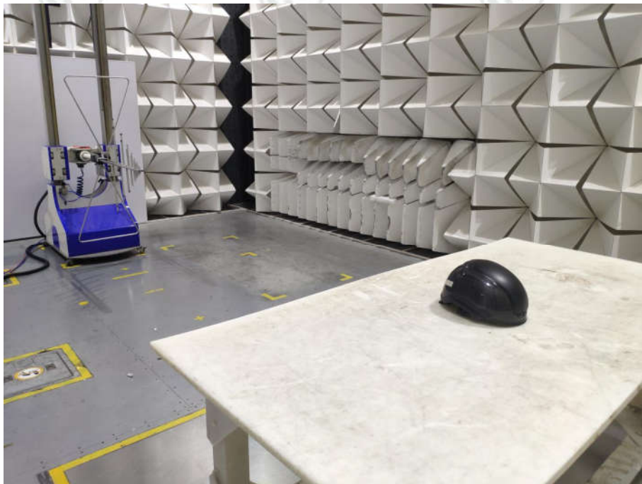
Radiated spurious emission Test Setup-2(Below 1GHz)