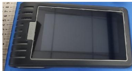
ArtiDiag800BT (Original Model)