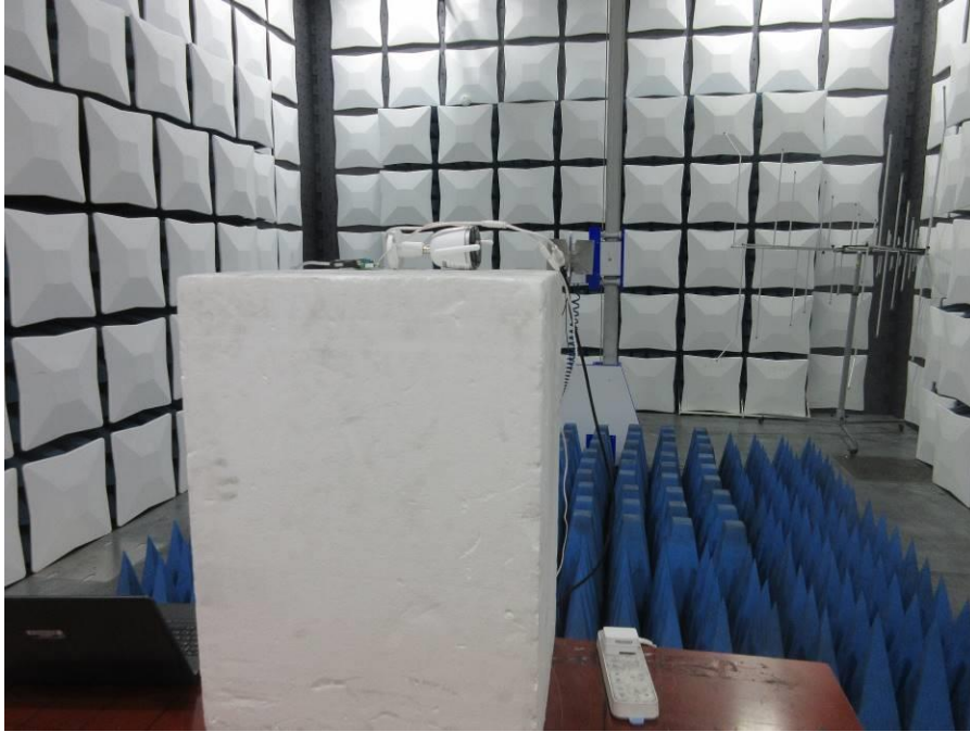
RADIATED RF MEASUREMENT SETUP (ABOVE 1 GHz- Y axis)