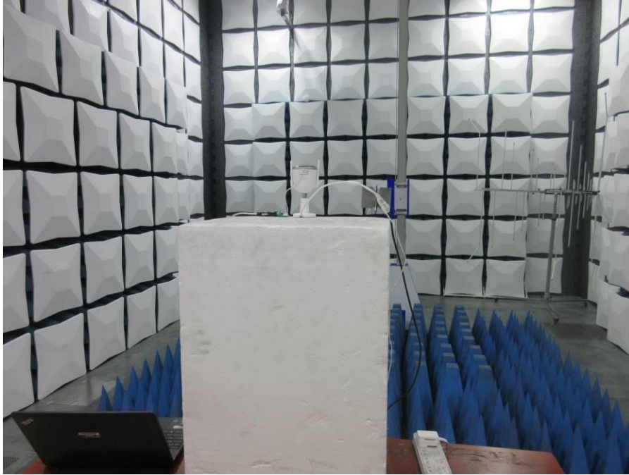
POWERLINE CONDUCTED EMISSIONS MEASUREMENT SETUP