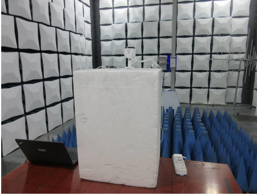
POWERLINE CONDUCTED EMISSIONS MEASUREMENT SETUP