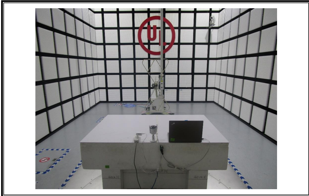
RADIATED RF MEASUREMENT SETUP (Below 30MHz)