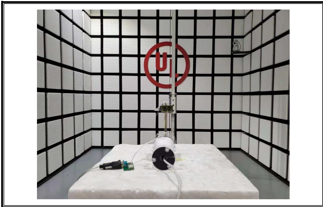
AC POWER LINE CONDUCTED EMISSIONS