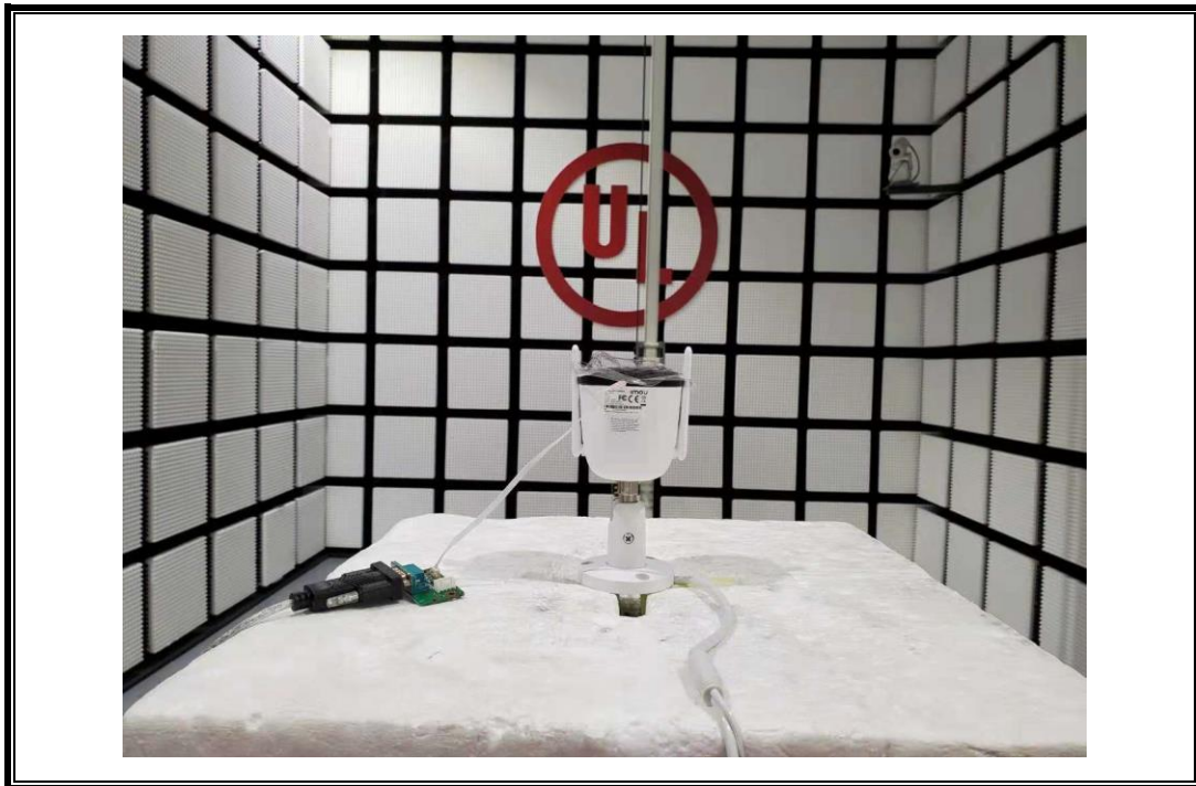
RADIATED RF MEASUREMENT SETUP (Above 1G – Y axis)