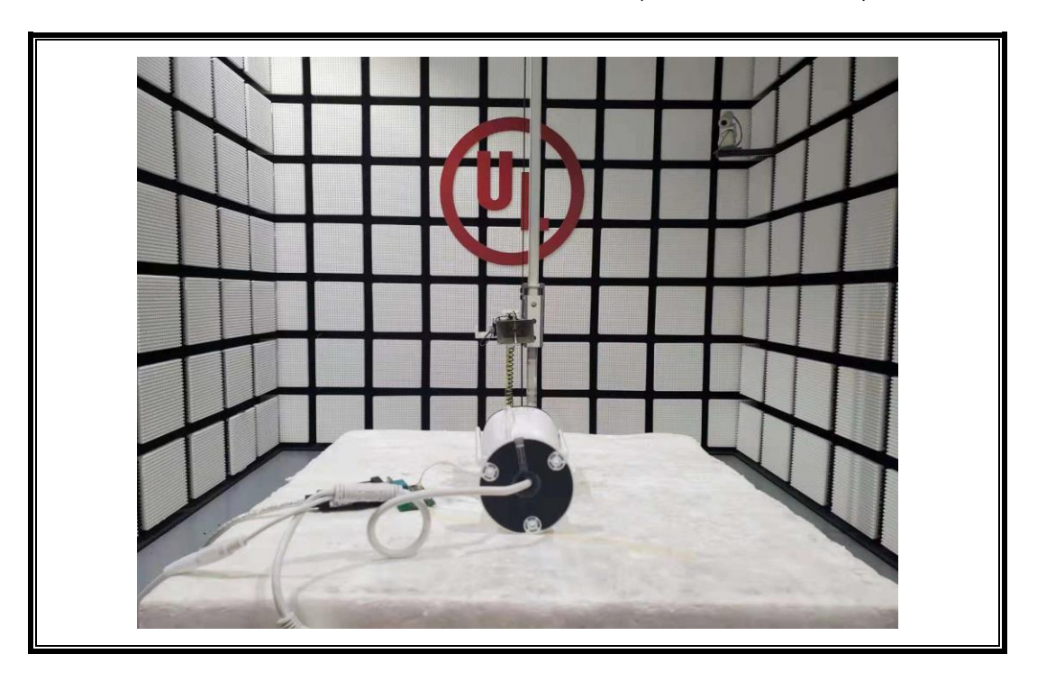
AC POWER LINE CONDUCTED EMISSIONS